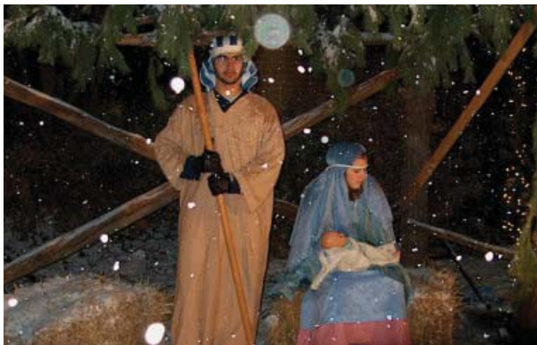
Live Nativity on Christmas Eve

Special dramatic presentation of the visitation of the Kings to the Baby Jesus.